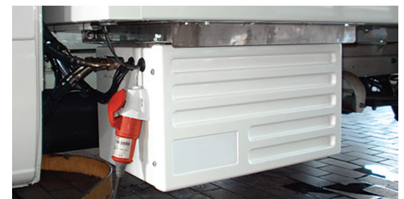
Stand-by kit for stand-by-refrigeration